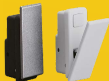
Recessed Hook (w/Soft Close) NF-45D (SC)