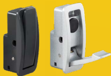
Retractable Hook W/ Damper NF-60D