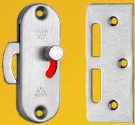
Stainless Steel Sliding Door Latch Surface Mount Type W/Indicator HC-85/S