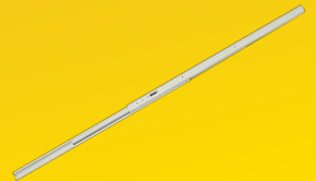
Full Extension Slide W/ Hold-Out Detent AR3