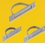
Hatch Pull Handles HR