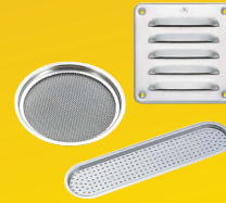
Stainless Steel Ventilators SAM, SAD, 1-1212, ASD