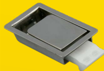
Slam Latches (Flush) LC-48, LC-65A