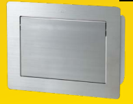
Stainless Steel Multi Purpose Lid w/ Soft Close AZ-GD231-HL