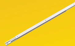
3/4 Extension Slide W/ Hold-Out Detent AR2