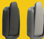
Folding Hook NF-47