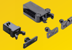
Non-Magnetic Latch ESN-195, MC-37 (Available with fixed or floating strike)