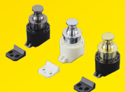
Push Knob Latch PKL-08