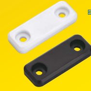
Sealed Magnetic Catches MC-JMP45