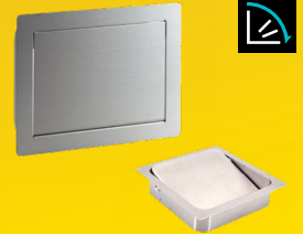
Multi-Purpose Lids AZ-GD310, AD-KH028-HL