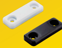
Counter Plate MC-JMP