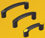
Specialty Handles w/ Color Options MJH