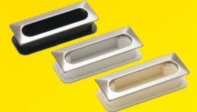
Recessed Pulls UTA-105