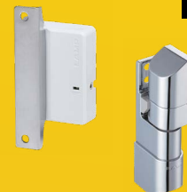
Soft-Close Hinges HG-JV65-U (Concealed), HG-JG150 (Gravity)