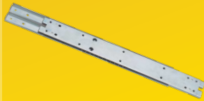
3/4 Extension Slides ESR-5 Series