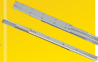
Full Extension Slides ESR-6 Series, ESR-10 Series, ESR-SC4513, ESR-DC4513