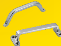
Stainless Steel Handles MG, FT-T