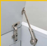
Adjustable Soft-Down Lid Stay NSDX-20RK