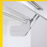
Vertical Swing Lift-Up Mechanism SLUN-3N