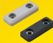
Sealed Mag. Catches MC-MS