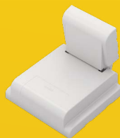
Power Assist Hinges HG-PA Series