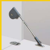
Flap Door Soft-Down Stay SDS-C100