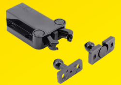
Non-Magnetic Latch MC-37 (Available with fixed or floating strike)