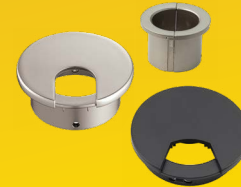
Grommets LS60F, CHC-S, LS-50S-S