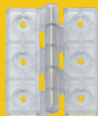
Butt Hinges HG-P100