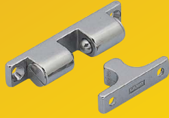
Tension Catches BCTS