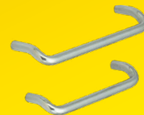
Offset Wire Pulls H-75-C Series