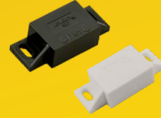
Sealed Mag. Catches MC-JM50