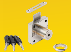
High Security Cabinet Cylinder Locks 7110-24-DN