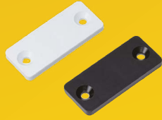
Ultra-Thin Mag. Catches MC-JM38