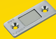
Stainless Steel Mag. Catches MC-149-SUS Mag. Force: 11 lbs