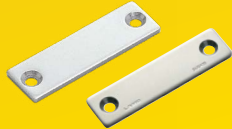
Stainless Steel Conterplates MC-JM49, AS-68