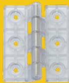
Butt Hinges HG-P100