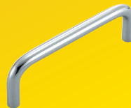
Wire Pulls H-42-C Series