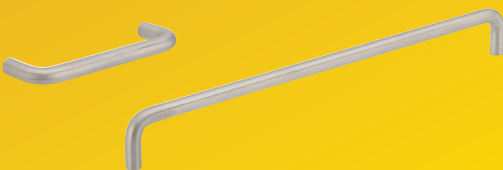
Wire Pulls SWP Series and SWF Series