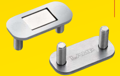
Stainless Steel Mag. Catches Back-mount Type MC-159-ST (Catch), MC-159U-ST (Counterplate)