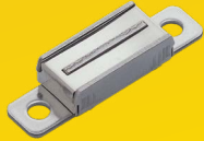
Stainless Steel Mag. Catches MC-YN05/MC-YN05-N Mag. Force: 6.6 ~ 16.5 lbs

Hermetically Sealed, No metal-to-metal contact.