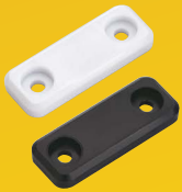
Sealed Mag. Catches MC-JM45 Mag. Force: 6.6 lbs