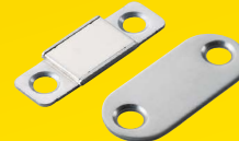
Stainless Steel Mag. Catches MC-YN016HP Mag. Force: 3.3 ~ 6.2 lbs